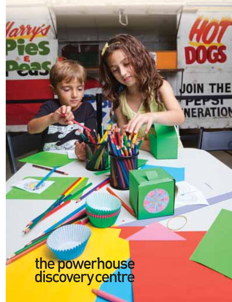
Front cover: Children enjoy holiday workshops, in front of the original Harry's Cafe de Wheels pie van (1945).